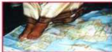
North West Africa