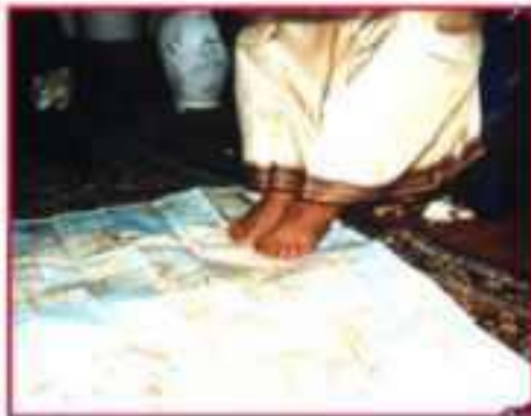
North East Africa