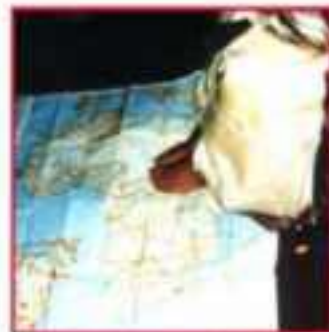
East & Central Africa