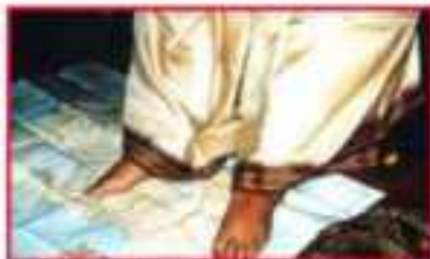
South & Central Africa